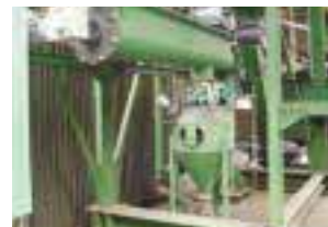
Waste sand pneumatic transfer unit

Also, to improve environmental communication with local residents, we invite them to the plant, introduce the past year's environmental efforts, and offer an opportunity to provide feedback.