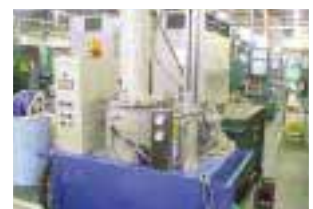
Distillation renewal equipment