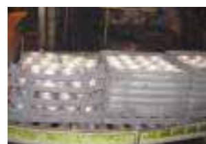
New, lighter tray used for heat treatment (right)