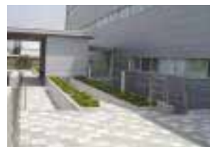
Walkway paving blocks made of waste media (grinding stones)

Moreover, we invite students from local junior high schools to give them an early opportunity to think about the environment, and through plant tours we show them examples of Iwata Works' environmental efforts in a way that is easy to understand.