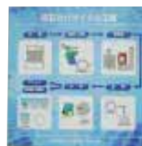
The grinding stone recycling process