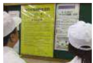
Posters showing RoHS directives posted