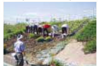
Planting flowers in the neighborhood

Also, we carried out job training within the company in preparation for the RoHS directive coming into force. This directive prohibits the use of six substances.