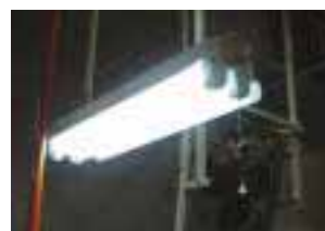
Fluorescent light with pull switch