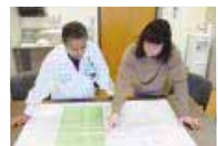
Review of the Environmental Management System aspects matrix.