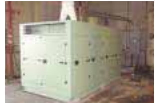
Variable-speed drive scroll compressor

We installed a variable-speed drive scroll compressor to help increase plant capacity. By doing this we are now able to adjust the amount of compressed air according to what is needed in the plant, reducing electrical consumption by 10%.