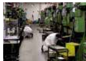
Checking for equipment air leaks