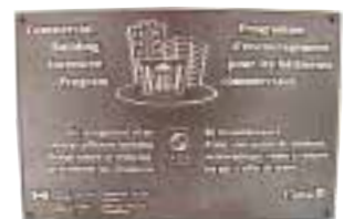
Award for energy efficiency from the Natural Resources Department