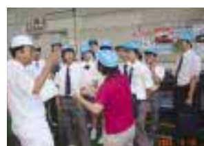
Giving an explanation in sign language on a tour for students from a school for the deaf