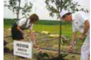
Planting white oaks

As the EU RoHS directive's effective date approaches, we held a seminar with 20 cooperating companies to avert the risk of environmentally hazardous materials becoming mixed into products. Through this, we were able to gain a greater understanding from our suppliers of the importance of managing environmentally hazardous materials.