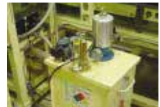
New rust inhibiting oil supply unit

Also, the Environmental Committee periodically reviews the environmental management system aspects matrix, and follows up to make sure that the plan is achieved.