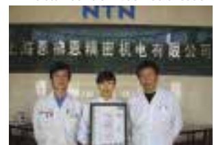
Obtained ISO 14001 certification

Each employee, determined to do what they can, is setting attainable targets and is starting environmental activities such as sorting waste streams.