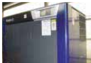
New compressor model with inverter

Also, to conserve energy, during "Environmental Month" (June), we conducted a plant-wide inspection to check for and repair air leaks on hoses.