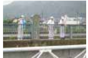
Measuring Tenryu River water quality

We were able to reduce roof surface temperature by using a heat shield paint that reflects sunlight. Because it reduces the load on air conditioners, we plan to apply heat shield paint on all of our roofs. We have continuously participated in "Tenryu River Water Environmental Activities" which follows the motto, "Let's make Tenryu River safe for swimming and create a recycling society". Last year, employees and their families participated in cleaning the riverside and monitored water quality for 24 hours.