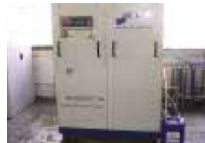
Vacuum distillation unit

Also, by implementing checks for compressed air leaks from equipment and piping, we reduced electrical consumption.