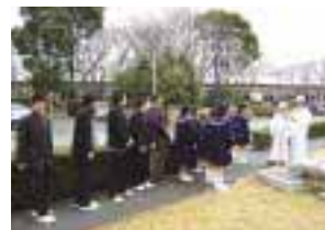
Receiving local junior high school students for an environmental learning session