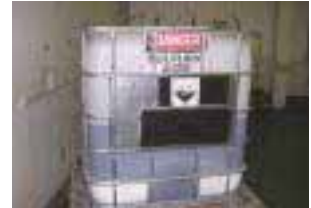
Spent sulfuric acid

Also, by sending cardboard to a recycler, we were able to divert 700 tons of waste from landfill.