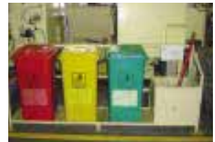
Waste sorting and storage area