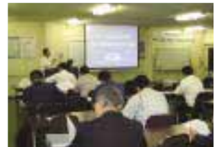
Holding the joint seminar for companies on managing environmentally hazardous materials