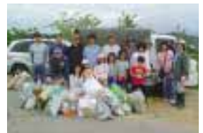
Tenryu River picnic (Riverside cleanup)