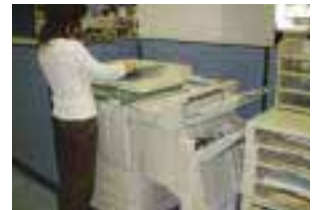
Implementation of the both side printing

Osaka City has specified the first day of each month to be a "Beautification Day" in which residents and businesses are called on to participate in a wholesale cleanup of the area. Our company's volunteer employees have beautified the local environment on the sidewalk along Yotsubashi-Suji Avenue doing early morning cleanups.