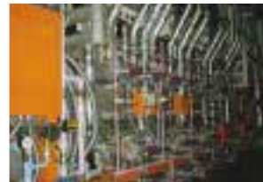
Heat treatment furnace converted to run on natural gas

Also, as part of our efforts to recycle waste, we are recycling our used grinding stones into new grinding stones.