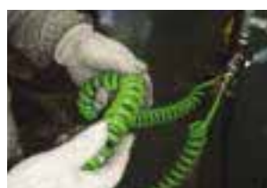
Inspecting for air leaks