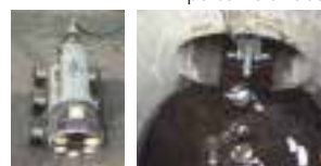
Pipe camera robot

Since last year we have responded to many requests from local schools for plant tours, and we are giving these tours as requested including tours of environmental equipment.