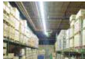
Adoption of high-efficiency fluorescent lights

In addition, we posted environment-related information on site so that we can raise the environmental awareness of employees daily.