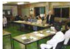
Meeting with local residents