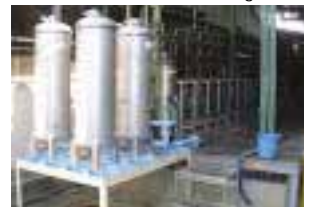
Reusing rainwater as heat treatment cooling water

By treating rainwater we were able to reuse it as heat treatment cooling water and reduce tap water consumption in our heat treatment processes by 25%. In addition, we publish "ISO 14001 News" quarterly to increase employee knowledge. Its slogan is "we will protect the global environment through individual action". It outlines both the amendment to the Energy Conservation Law and the Osaka prefectural global warming prevention ordinances.