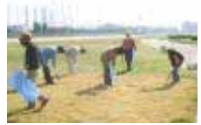
Cleaning up the Muko River riverside

The Muko River, which originates in the faraway Tamba Highlands, is a clear stream that seems appropriate in Takarazuka, a famous tourist destination and a favorite place for local resident to take walks. To clean up the riverside, employees participated as volunteers in the "Mukogawa Riverside Park Beautification Committee" by picking up garbage, etc. Also, because Takarazuka works is next to Takarazuka City Hall, we have established strict voluntary standards more stringent than the legal requirements to enhance this public area. We are also actively engaged in greening the grounds.