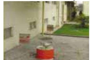
Waste oil storage area

Also, by changing the colors of the containers for each type of waste, we made it easy for employees to correctly sort their waste.