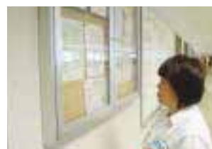
Posting of environment related information