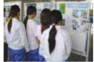
Display of plan of environmental activities

In fiscal 2004, we received ISO 14001 certification and since then we have steadily implemented various environmental activities. In fiscal 2005, we put in place a waste storage area, making it possible to sort and recycle waste and safely manage hazardous waste.