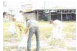
Cleanup of the Gonushi Coast

In addition, by using distillation regeneration equipment to process used oil, we were able to recycle the oil into the one that has the same performance as new oil, resulting in cost savings.