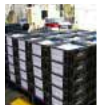
Returnable plastic tote

Our building expansion was built using a state-of-the-art heat recovery system that uses waste compressor heat in the winter to pre-heat incoming air. In recognition of this, we received an award for energy efficiency from the Natural Resources Department of the federal government.