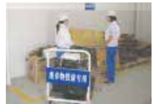
Waste storage area