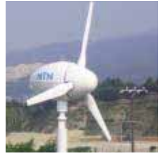
Wind power generator