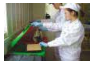
Waste sorting and storage area