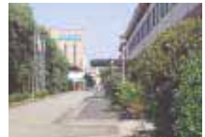
Greening our grounds