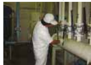
Checking for air leaks

Also, we saved energy by adopting pull string switches for our lighting and turning on the lights only when needed.