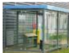
Outside smoking space

Also, we created posters showing the new environmental targets for fiscal 2006 and posted them in the plant to increase employee knowledge and awareness.