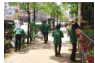
Cleaning activity around the NTN head office