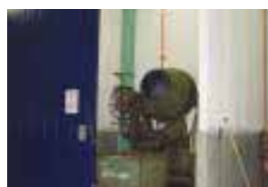
Building with improved noise insulation