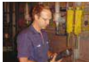
Adjusting the furnace burner

To maintain the optimum gas-air ratio, we adjusted the furnace burners twice a month, resulting in a savings of 375ft 3 /hour (approx. 12%) on #1 Surface Carburizer. Additionally, dramatic gas savings were achieved by replacing the existing furnace trays with 40% lighter ones. As a result of these initiatives, electrical consumption was 21% less and gas consumption was 23% less in 2005 than in fiscal 2003.