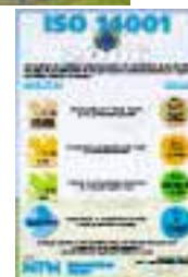
Poster of the environmental targets