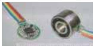
Magnetic array-type rotation sensor (left) Ball bearing with magnetic array-type rotation sensor (right)

The newly-developed sensor has magnetic sensor elements, an AD conversion circuit, and an angle calculation circuit integrated on a 4.2mm square sensor chip to simultaneously reduce size and improve functionality.