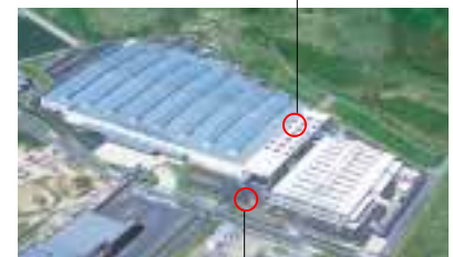
NTN Mie Works