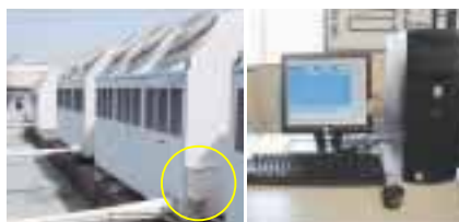
Control equipment installed in outdoor air conditioning units (3 unit group)

This system conducts centralized control of several compressors in the building using computers. Randomly selected compressors are switched off for several minutes during a given period of time and air conditioning is switched to fan and as a result we were able to maintain a comfortable room temperature while reducing energy consumption.