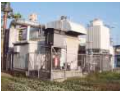
Co-generation facilities (NTN Powder Metal Corporation)

In the past, the NTN Group has introduced co-generation facilities at four operating sites. The power generated is used onsite and by utilizing heat exhaust, we are able to reduce CO 2 emission.