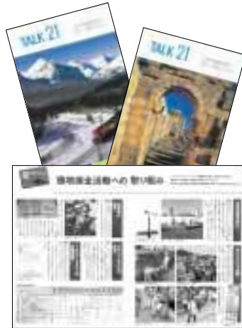
NTN Group Newsletter

Additionally, we have a page for environmental issues in our company newsletter with the basic information we would like our employees to understand, such as the contents of the EU Directive to regulate toxic substances and our countermeasures, written in easy to understand terms so that each of our employees understands the background and importance of our environmental activities.