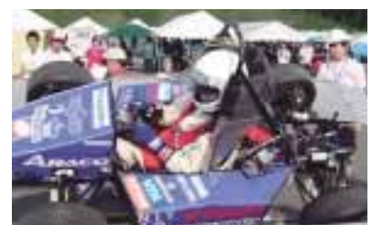
Nagoya Institute of Technology Racing Car

At the "2nd Student Formula SAE Competition of Japan" held in Tochigi, last August and September, 12 of those universities participated and the Shibaura Institute of Technology team (a team supported by NTN) came in fourth place.